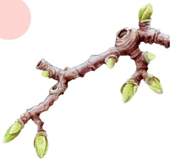
Bud on a tree